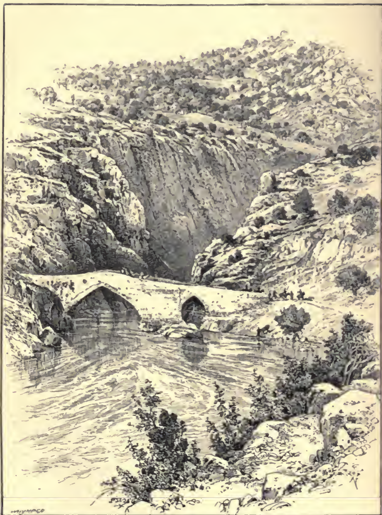
THE KARUN AT DUPULAN.